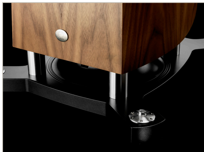
Close-up of precision-machined stand